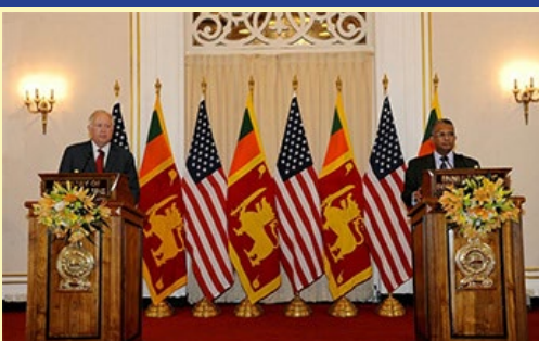
Click here for more moments

As fellow democracies, the two governments resolved to work together toward a free and open Indo-Pacific region and for greater peace and stability around the world. The United States and Sri Lanka agreed that the security, stability, and prosperity of the Indian Ocean region should be safeguarded through the promotion of a rules-based order which would ensure that all countries that enjoy the global commons respect international