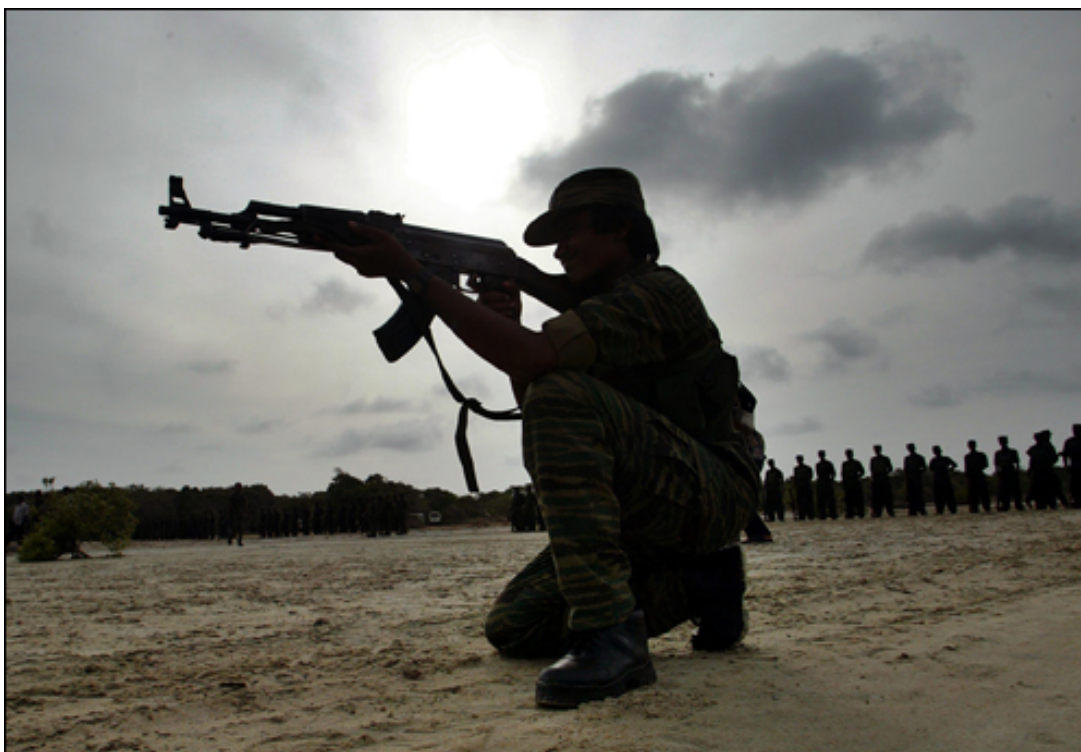
A woman fighter of the Tamil Tigers takes a shooting position in Sri Lanka in July 2007.